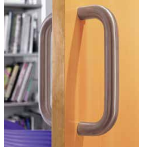
Matching cabinet pull - page 26