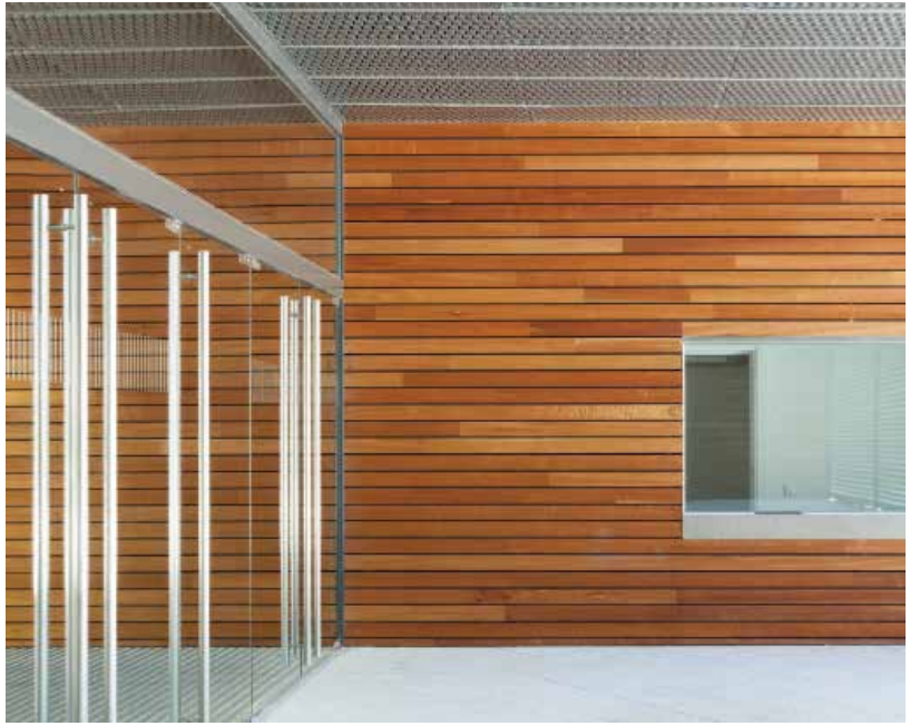
Matching cabinet pulls - page 23, 24 and 25