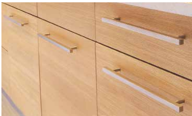
Matching appliance and door pull - page 40